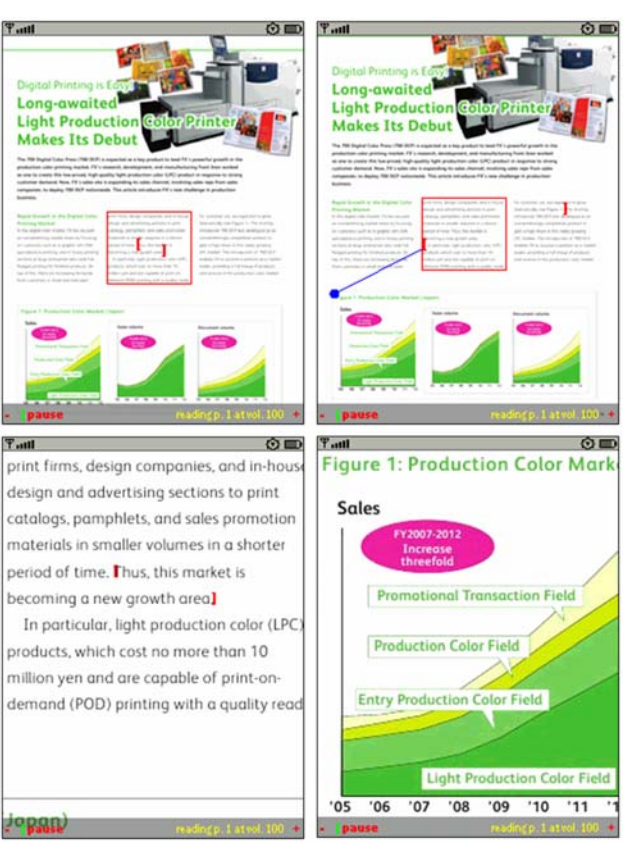
reference can be used to change the visual display,

SeeReader is the first mobile document reader to support rich documents by combining the affordances of visual document reading with auditory speech playback and eyes-free navigation. Traditional eReaders have been either purely visual or purely auditory, with the auditory readers reading back unstructured text. SeeReader supports eyes-free structured document browsing and reading as well as automatic panning to and notification of crucial visual components. For example, while reading the text "as shown in Figure 2" aloud to the user the visual display automatically frames Figure 2 in the document. While this is most useful for document figures, any textual