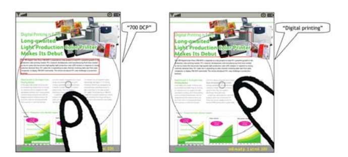
Figure 3: A user interacting with the touchwheel. As the user drags her finger around the center of the screen, the application vibrates the device to signal sentence boundaries and plays an audio clip of the keyphrase summarizing each region as it is entered.

Users can select the document they wish to read via either the number pad or by directly pressing on the screen.