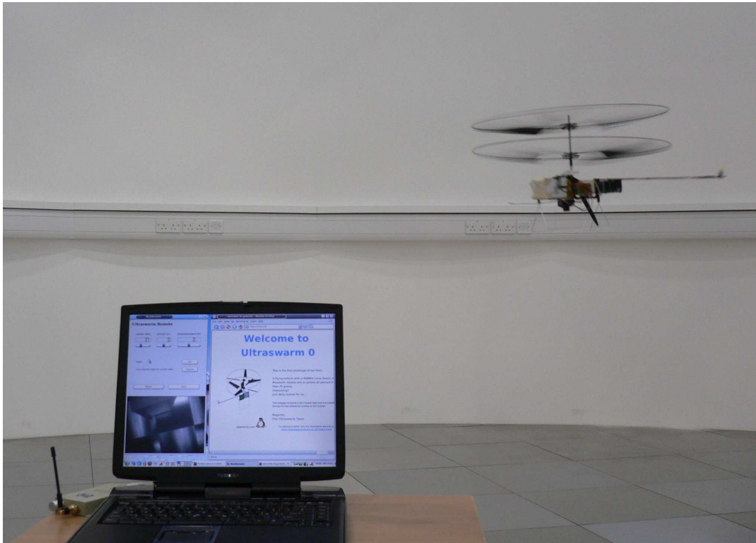
Figure 5. This shows a modified Proxflyer machine, with camera and Gumstix board, hovering in the arena. It is being remotely controlled via the Bluetooth link from the ground based computer – the control interface is visible in the top left of the screen, and the relatively large and heavy aerial can be seen pointing downwards from the body of the helicopter. The bottom left of the screen shows the view from the camera. The right half of the screen shows a web page served up over the Bluetooth link by the web server running on the Gumstix board.